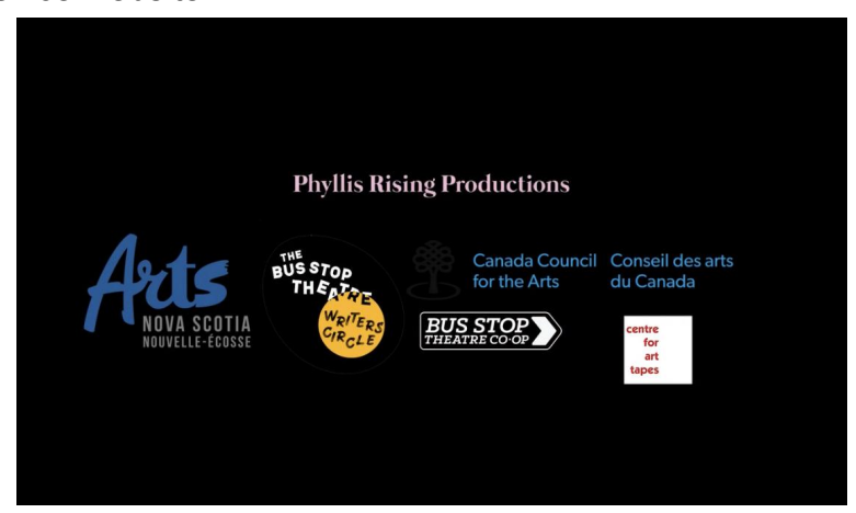
small logos @ end credits, season one